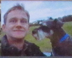
Buddy 2007-13, my best mate