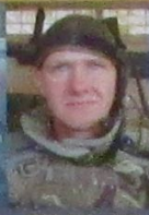
2012 Afghan tour