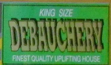
1994, four crazy months in the Philippines