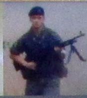
1986 Germany training