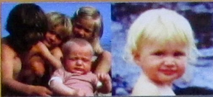
1970, my first breaths taken in Greater Manchester