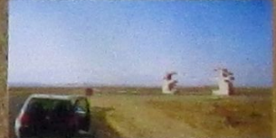
2004/05, an indulgent tourist in Thailand for a year, half in Pattaya & half in Bangkok