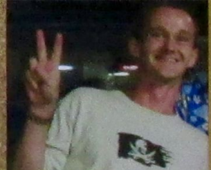
2006/07, eight months in wonderful Colombia (on the wrong side of the tracks)