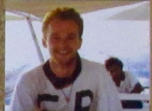
1995/96, Bolivia to Colombia overland