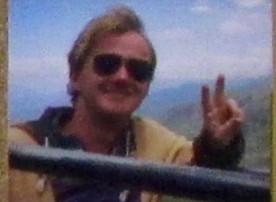
2003/04, I drove Manchester to Marrakech, via some voluntary work in the High Atlas