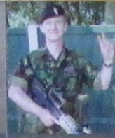
2009 Territorial Army