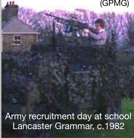
Army recruitment day at school Lancaster Grammar, c.1982