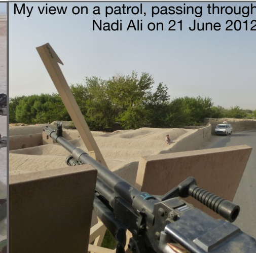
My view on a patrol, passing through Nadi Ali on 21 June 2012