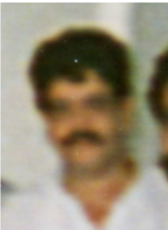
I think this was the senior engineer at the factory in Sept 1997

early 1998 9/11 attack plan was activated / initiated (my impression from trawling & filtering the internet).